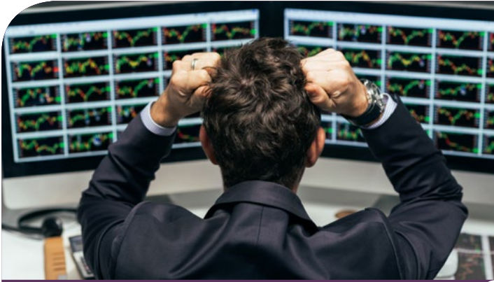
Classic Currency Brokers